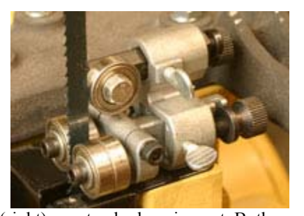
Full roller guides upper (left) and lower (right) are standard equipment. Both feature easy-to-adjust dials for making precise, tool-free adjustments of the side and thrust bearings.

operated dials make ultra-precise positioning of the side and thrust bearings fast, simple and tool free. Adjusting the side clearances is also done quickly using a 3mm hex wrench.